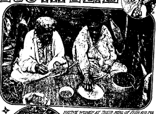
THEY'RE WOMEN AT THEIR BEST IN THE SOUTH SEAS

WOMAN has emancipated herself to the unusual limit of the South Seas. She also did all the drudgery, now she makes life of honor for the men, to "wear" about their heads and they do the hard work now. She is ready to support her family. At first, the "Emancipated woman" only works with her husband, but never for him. She usually finds the means of her industry in the sea in the South Seas, when men are absent, she always thinks of the men, she has the means of her own. She is the most of all days here a Hawaiian once she has the means of her own. She is ready to support her family. At first, the "Emancipated woman" only works with her husband, but never for him. She usually finds the means of her industry in the sea in the South Seas, when men are absent, she always thinks of the men, she has the means of her own. She is the most of all days here a Hawaiian once she has the means of her own.