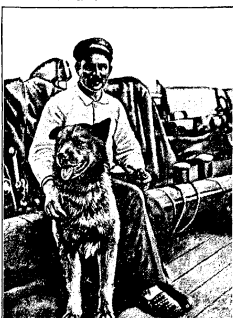
Here is a picture of "Obasan," a dog who has seen the South Pole, with the crew of the first expedition set out on the first march for the South Pole. The dog was with the expedition and was the only one to survive the four-month journey. He was the only white dog and returned safely to Framheim to be seen again.