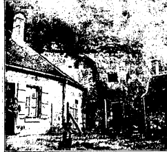
All European, a little village in the department of the Aisne, in the north east part of France, has just discovered a new dwelling, a specimen of whose habitations is shown in the accompanying illustration.