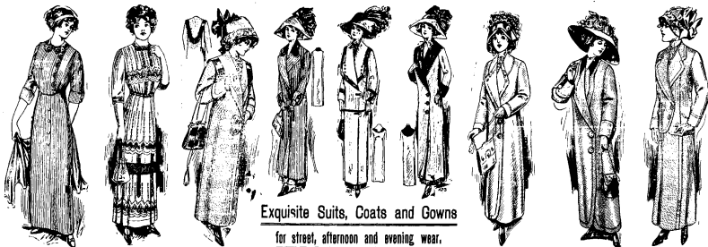
Exquisite Suits, Coats and Gowns for street, afternoon and evening wear.

BE A VISIT TO THIS STORE DURING EASTER WEEK WILL BE PROFITABLE TO EASTER SHOPPERS.