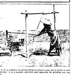
It is a variety of curious things in various ages, one of which is here illustrated. It is a queer contrivance, used especially for grinding rice into flour.