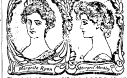
Two Grateful Letters from Women Who Avoided Serious Operations...

Two Grateful Letters from Women Who Avoided Serious Operations... (Another testimonial about avoiding surgery.)