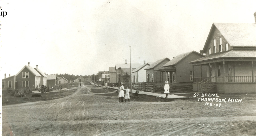
Corner of Manistique Avenue & Main Street—Thompson, MI