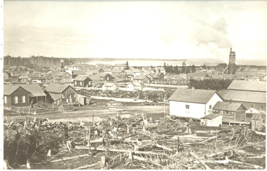
View of Thompson 1890's