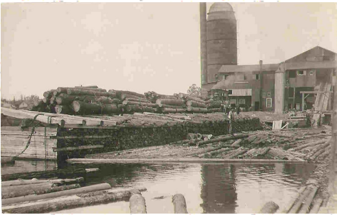
Thompson Lumber Mill

“Thank you for the info, but not sure I can attend. At the age of 82, long trips are not for me, but I will be with you all in spirit. You have done a great job in getting this off the ground. “