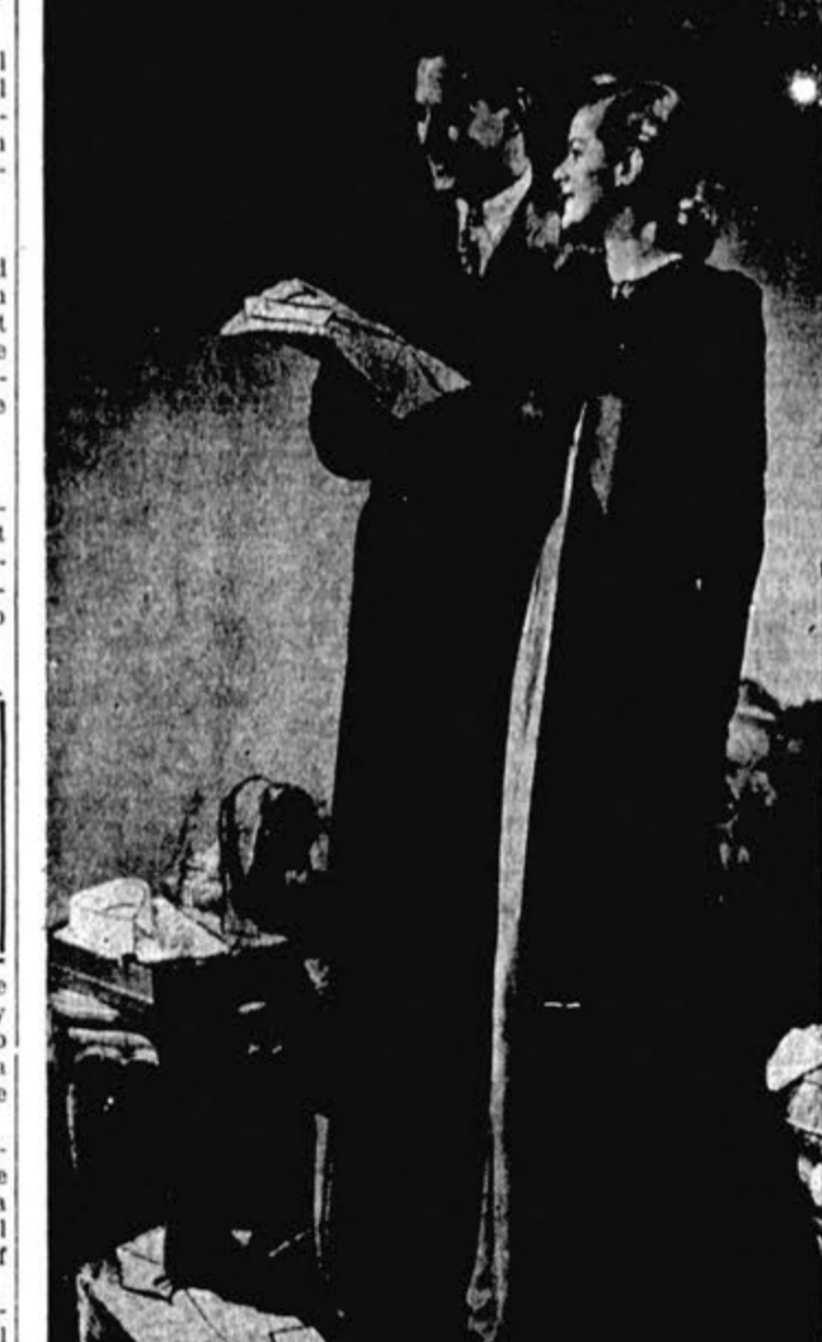
The hostess gown is a mantle coat of purple silk duchess satin over a beige faille slip with corselet waistline. The man's robe is of maroon silk satin in a smart jacquard weave.