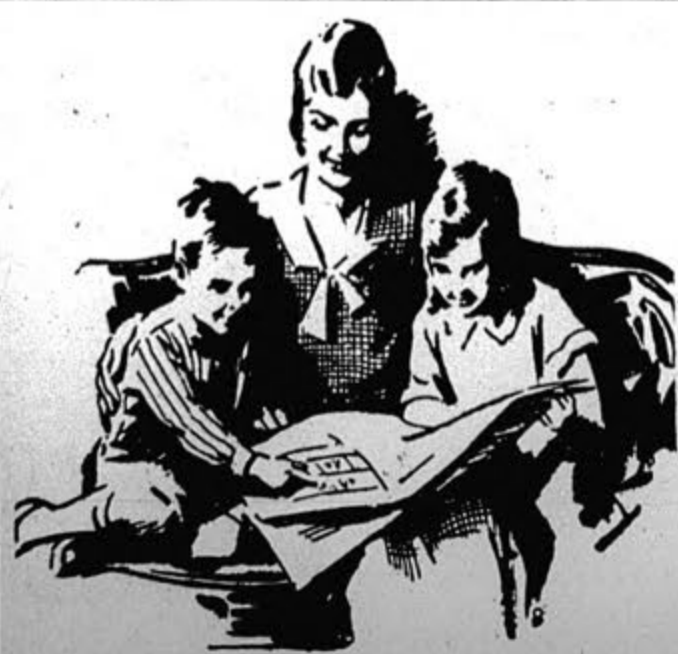
A FAMILY NEWSPAPER