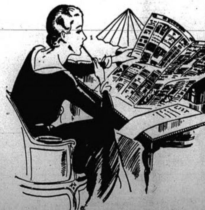
THE SHOPPERS GUIDE