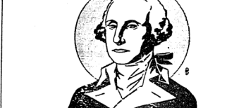
GEORGE WASHINGTON (Born February 22, 1732)