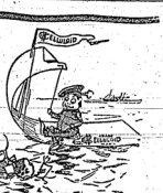
COLLARS AND CURTS that are made of proof. Never wilt and not subject to moisture. Clean, neat and comfortable.

Dr. Ross's Bismuth Cure is a new and powerful medicine for the cure of the Piles unless you get a box of Dr. Ross's Bismuth Cure.