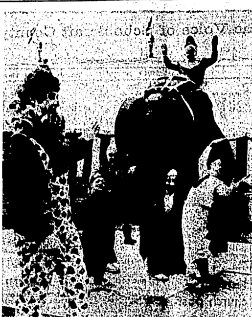
CLOWNING AROUND —One of the most popular features of any circus is the clown, and there'll be a full crew on hand Wednesday, July 30, when the Sells & Gray Circus will be in Manistique for performances at 2 and 8 p.m., under the auspices of the Manistique Jaycees.