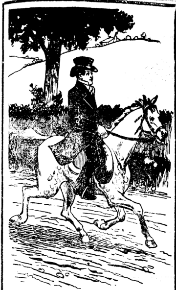
No old-time doctor discards the medicine which can show an unbroken record of