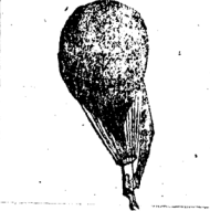
READY FOR THE DROP.