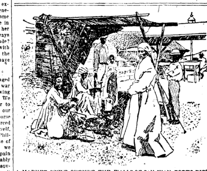
A MARKET SCENE OUTSIDE THE WALLS OF SAN JUAN, PORTO RICO.

any movement looking to a wider sphere of operations by the United States, and think the government unwise which we are read does not admit of anything approaching a colonial system. I am, however, one of those who have faith both in the capacity of the American people and of their government to control, regulate and govern any colonies in any part of the world which they may find it necessary to their interests to establish. A free constitutional government, where the press is untrammelled, education is free, religious tests are forbidden, and intelligence is widespread is the best government to insure safe, just, and prosperous colonial establishments. Such a government is the United States, and such is that of Great Britain. "Dewey, by his brilliant victory, has, almost in the twinkling of an eye, opened to us the opportunity for a foothold in the East. The discussion as to whether we should avail ourselves of this opportunity, and if so, whether the Americans and their government would be able to manage and govern the Philippine Islands successfully, but whether any government established by any other people could do so, for the Americans and their gov-