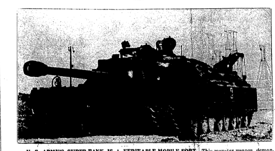
U. S. ARMY'S SUPER-TANK IS A VERITABLE MOBILE FORT. This monster weapon, demonstrated recently at the Aberdeen (Md.) proving grounds, weighs 100,000 tons. It moves on double tracks, each 18 inches wide, and mounts a high velocity 105-millimeter cannon and a 50-calibre machine gun. It is operated by a crew of four men.