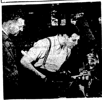
Michigan is among the first states to offer vocational training and rehabilitation to tuberculosis patients who cannot return to their former jobs. The training, given while the patient is recovering in a sanatorium, is planned to enable him to do productive work that will not endanger his health.