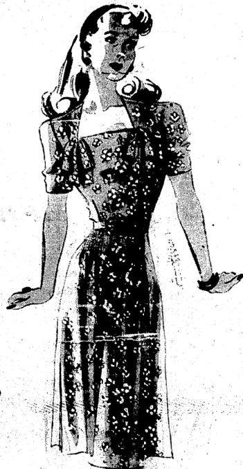
Dainty floral print. Square neck shirred hips, bows. $12.95

Gay as the chirp of the first robin of spring are these sprightly print silhouettes. One and two piece charmers softly designed—shirred here and there touched with bows—lined with buttons. For a colorful and flattering spring come in now and choose from our outstanding group of first editions.