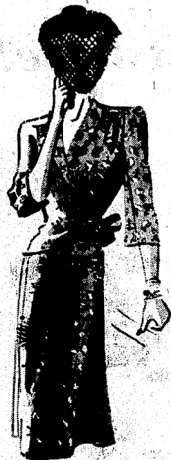
Side buckled two piece in pretty floral print. $10.95