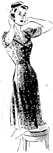
Button-down front classic in dainty print. $8.95

Gay as the chirp of the first robin of spring are these sprightly print silhouettes. One and two piece charmers softly designed—shirred here and there touched with bows—lined with buttons. For a colorful and flattering spring come in now and choose from our outstanding group of first editions.