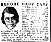
BEFORE BABY CAME