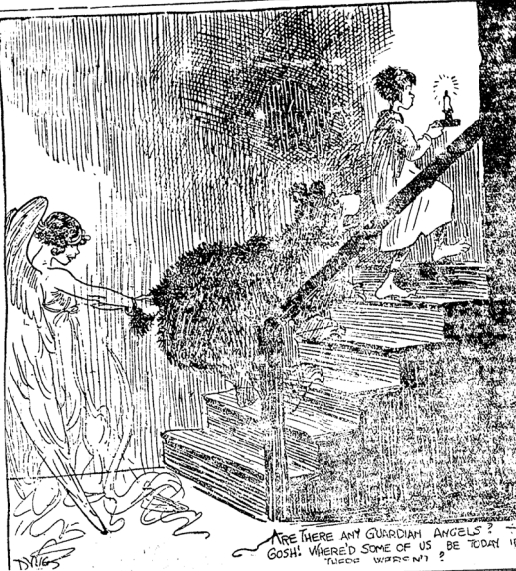
ARE THERE ANY GUARDIAN ANGELS? GOSH, WHERE'D SOME OF US BE TODAY IF THESE WERE ANY?