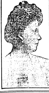
ALFONSO'S QUEEN IS BLAMED

Dined by Clericals for Break With the Vatican.