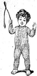
This is MUNSING

Three things to remember--to have your name and your parents' name and address plainly written on bottom of this ad--to bring your guess to the underwear department accompanied by parent or adult--to have your guess entered not later than one week from date of this paper.