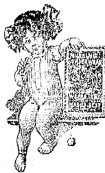
This is MOLLY MUNSING