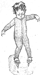
This is MUNSING