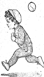
This is MUNSING