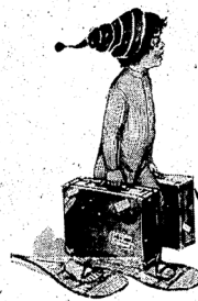
This is MUNSING