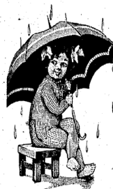
This is MUNSING