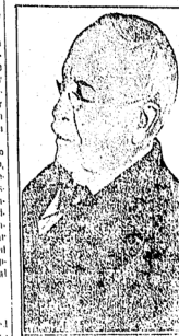
WILLIAM DEAR HOWELLS.

New York, Dec. 1.—A novel non-partisan political organization, with many prominent men from this city and throughout the state on its roster, was mentioned in New York under the name of the Men's League for Equal Suffrage.