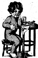
This is MUNSING