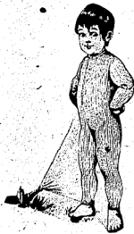
This is MUNSING