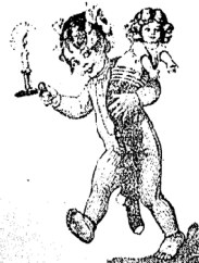
This is MUNSING