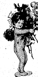
This is MUNSING