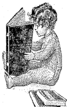
This is MUNSING

WHEN a big manufacturer asked us to put this large ad in the paper and then unfolded a plan by which, if we would do so, we could gladden the heart of every child in the community, and interest many parents in the merit of Munsing Union Suits we eagerly complied with his request.