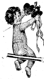
This is MUNSING