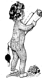
This is MUNSING