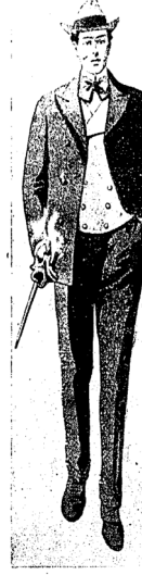
THE 1901 SUMMER MAN.