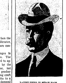
LATEST FASHION IN HAT.

distance might easily be mistaken for a frigate with "all standing."