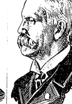
COLONEL ALBERT SHAW.

The British court is called the court of London. It is the official headquarters of the British court.