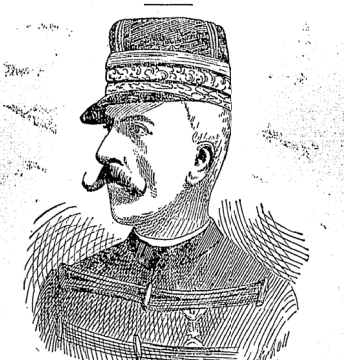
This famous French soldier is an artistocrat by birth and inclination. He is also a devout worshiper of the flag of the French army, and has consented to serve in the present cabinet merely so that justice shall be done to the unfortunate and neglected Dreyfus.

barren to walk at the side of the casket. The removal basket is a modern method of conveyance, used by undertakers for the removal of bodies from hospitals or homes or other places where it might not be convenient or desirable to carry a cumbersome lead coffin.