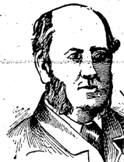
SIR ARCHIBALD GEIKIE.