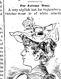
FOR AUTUMN WEAR.

'For Autumn Wear. A very stylish hat for September and October wear is of white ermine, lined with blue velvet.'