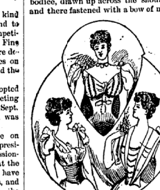
THREE EVENING BODICES.

To be fashionable one must wear an airy something of gauze or chiffon, fluttering with ribbons and brilliant with jeweled passementerie.