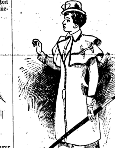
CHURCH STREET COAT.

A Great Coat. The tendency of street garments for fall and winter is to a full and broad effect about the neck and shoulders.