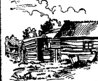
BEST HOMESTEAD TAKEN IN THE UNITED STATES.

The land lies four and a half miles northwest of Beatrice and numbered 19 acres.