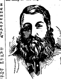
ABDURRAHMAN KHAN. The fighting and has appealed to that guardian of the rights of mankind...