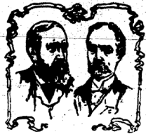
For President, BENJAMIN HARRISON. For Vice-President, WHITELAW REID.

Republican County Convention. There will be a Republican County Convention held at the Court House in the village of Manistique on Thursday July 7th, at 2 o'clock P. M. for the purpose of electing two Delegates to the State Convention at Saginaw July 20th, 1892 and four delegates each one severally to the Congressional, Senatorial and Representative Conventions not yet called.