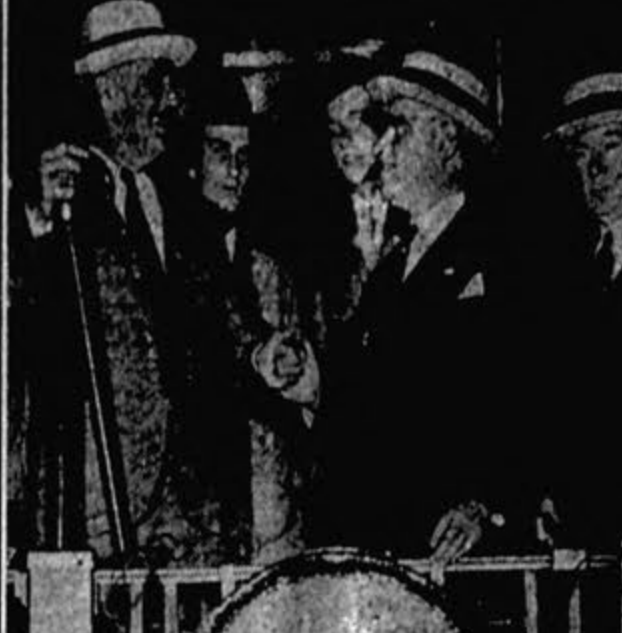
Off for a trip across the nation and back again in an effort to increase his strength in normally Republican states, Governor Franklin D. Roosevelt is pictured above (left) as he bade good-bye to Lieutenant Governor Herbert Lehman as the "Roosevelt Special" left Albany.