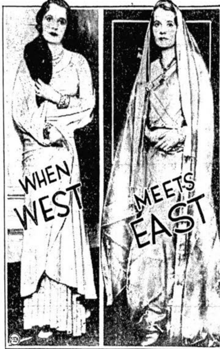
She helps spend $10,000,000 a year!—Here you see Princess Aga Khan, former Paris shop girl, who now helps her Indian-potentate husband spend the $10,000,000 he is reported to receive from his followers each year. She is shown, left, as she appears in a Parisian costume and at the right is a recent picture showing how she dresses in India. Aga Khan, a famous sportsman, is spiritual head of some 30,000,000 Mohammedans.