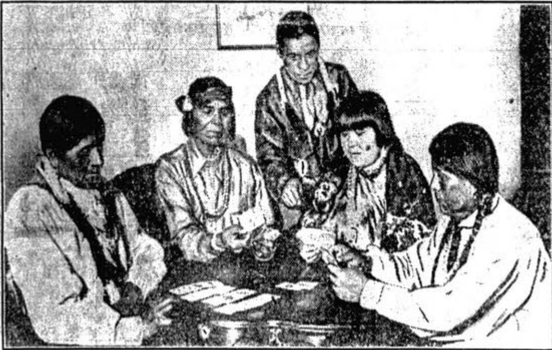
Maybe the current Lenz-Culbertson contract bridge battle had something to do with it, at any rate this group of Indian artists in New York for an exposition of Indian tribal arts, are shown playing a rubber during a recess. Indians from New Mexico and the Navajo country are taking part in the exposition of paintings, pottery, weaving and other arts.