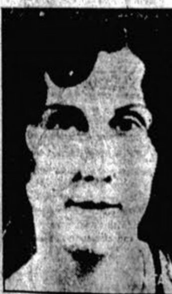
Widow Named Successor To Slain Sheriff