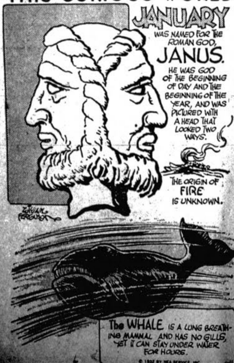
JANUARY WAS NAMED FOR THE ROMAN GOD, JANUS. HE WAS GOD OF THE BEGINNING OF DAY AND THE BEGINNING OF THE YEAR, AND WAS PICTURED WITH A HEAD THAT LOOKED TWO WAYS. THE ORIGIN OF FIRE IS UNKNOWN.