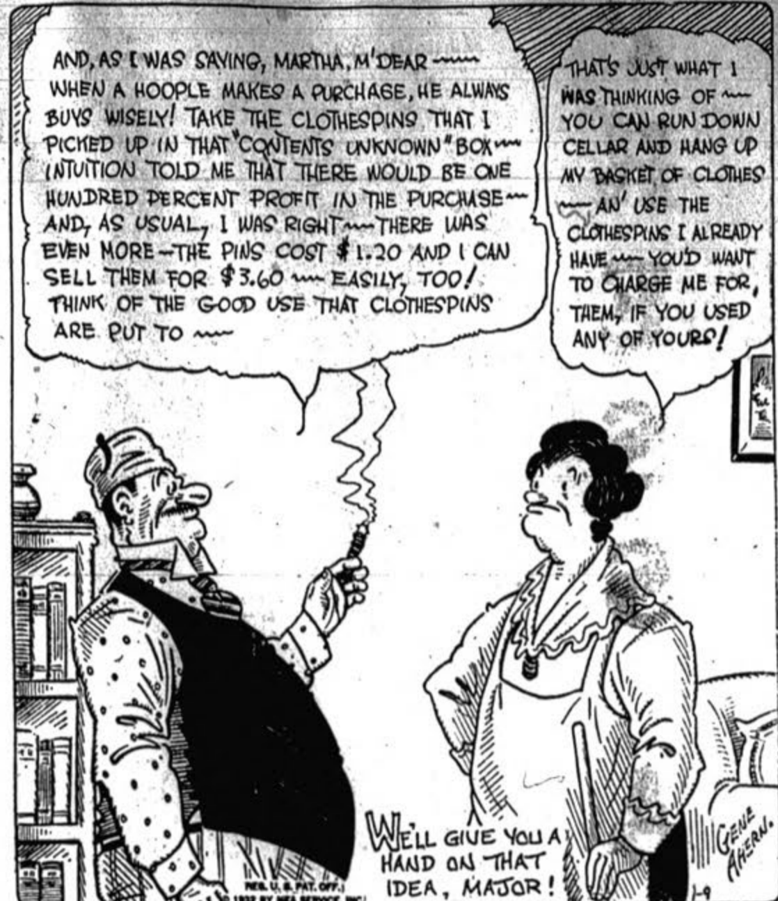
WE'LL GIVE YOU A HAND ON THAT IDEA, MAJOR!