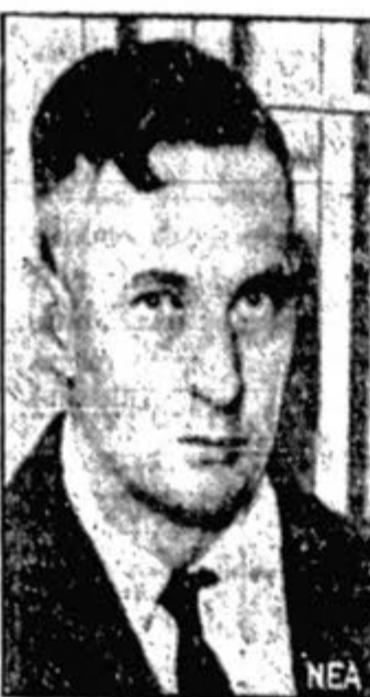
HELD IN DEATH OF WIFE, CHILD