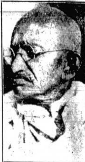
GANDHI JAILED AS BRITAIN HITS AT CIVIL DISOBEDIENCE

Mahatma Gandhi, Indian nationalist leader, was sent to jail when he prepared to renew his civil disobedience campaign.