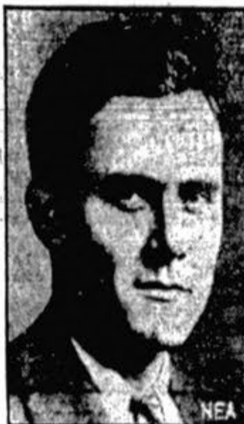
SECOND REPORTER BARRED BY JUDGE