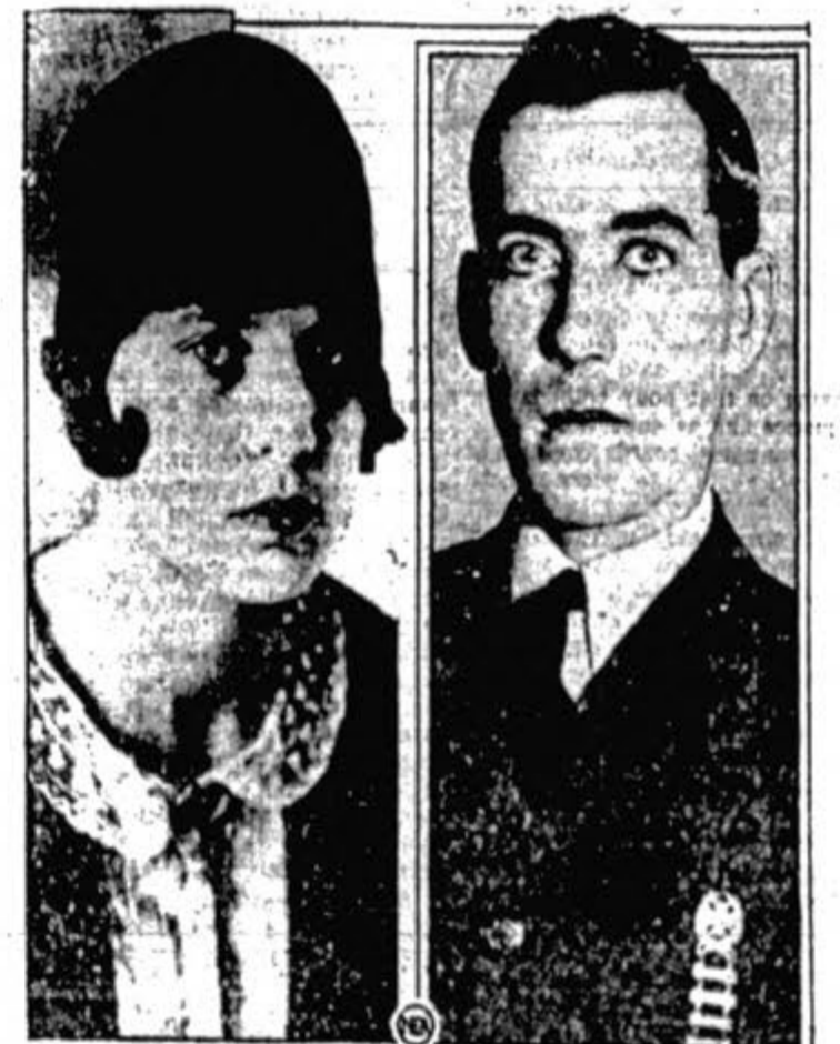
EX-MARINE CHIEF'S DAUGHTER TO MARRY —A MARINE