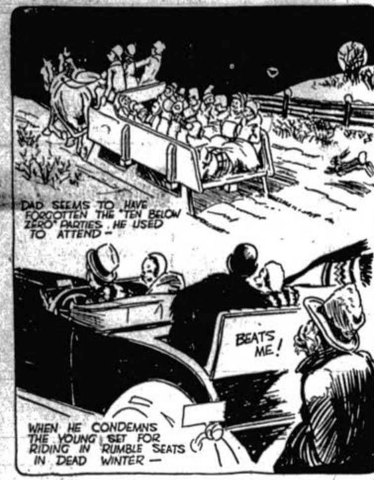
DAD SEEMS TO HAVE FORGOTTEN THE TEN BELOW ZERO PARTIES - HE USED TO ATTEND. WHEN HE CONDEMNED THE YOUNG SET FOR RIDING IN RUMBLE SEATS IN DEAD WINTER - BEATS ME!