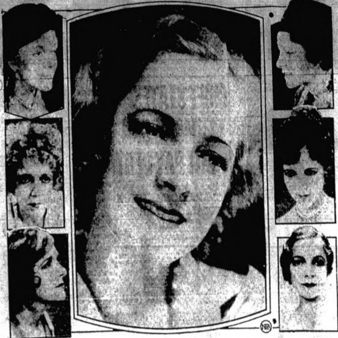
Back on Broadway after starring in a Hollywood film production, Helen Hayes, center, is delivering an excellent performance in a Molnar comedy. At left and right you see successive examples of her character work in the picture, "The Sin of Madelon Claudet," in which Miss Hayes starts as a young girl and ends as a little old woman.