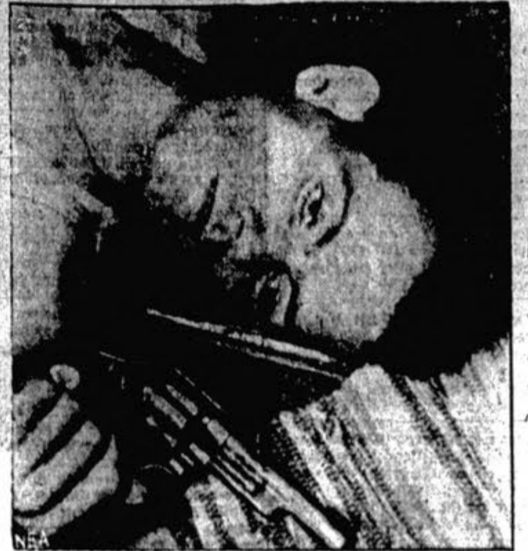
THE END OF A CAREER OF CRIME