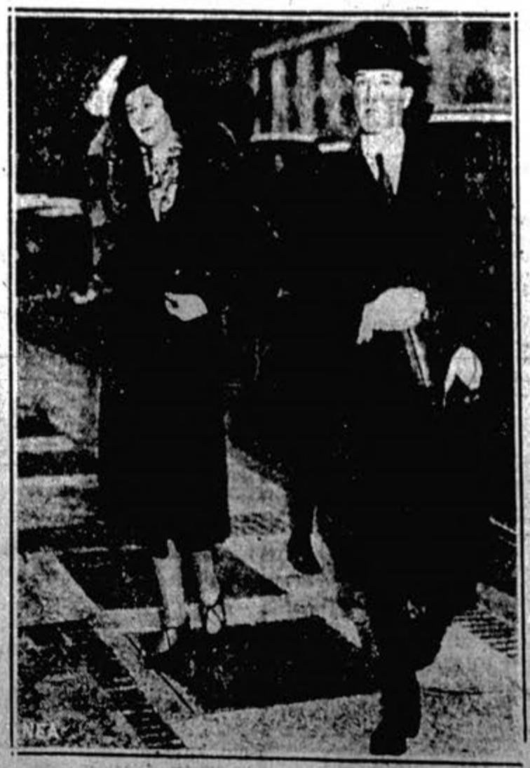
BANKER ENTERTAINS EX-WIFE