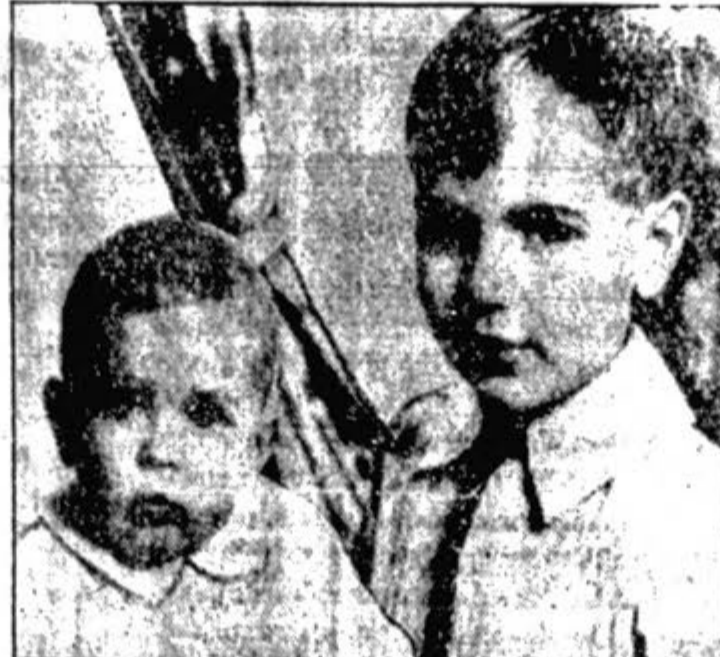
CHILD VICTIMS OF NURSE