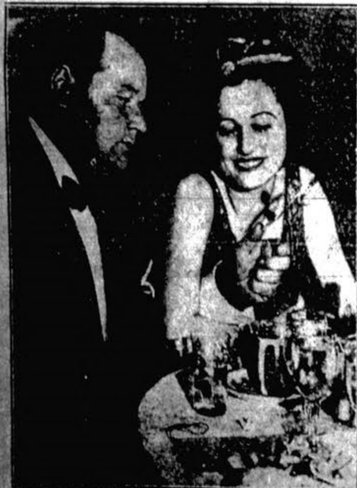
'FATTY' AND FIANCEE AT PLAY