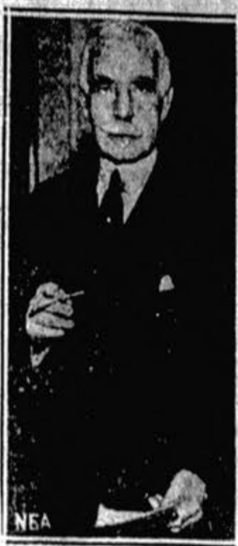
URGES RETENTION OF GOLD STANDARD

The United States does not need to follow the example of foreign powers in going off the gold standard. That was the testimony of Otto H. Kahn, famous banker, when, as pictured above, he appeared before the Senate finance committee in Washington.