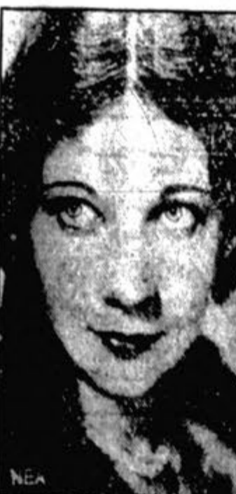
FIRST '32 BRIDE IN HOLLYWOOD