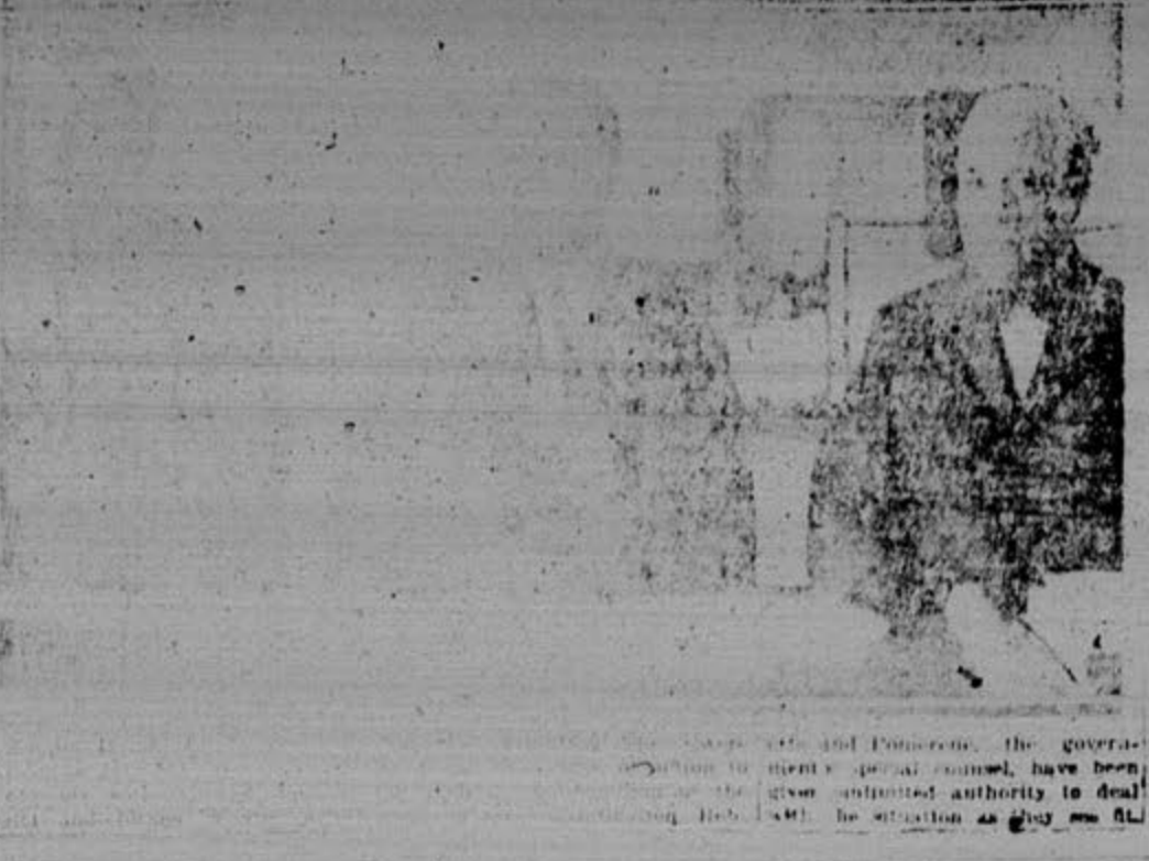
Senator Lenroot in session with Federal Council

The Federal Council... in session... with Senator Lenroot... behind closed doors.