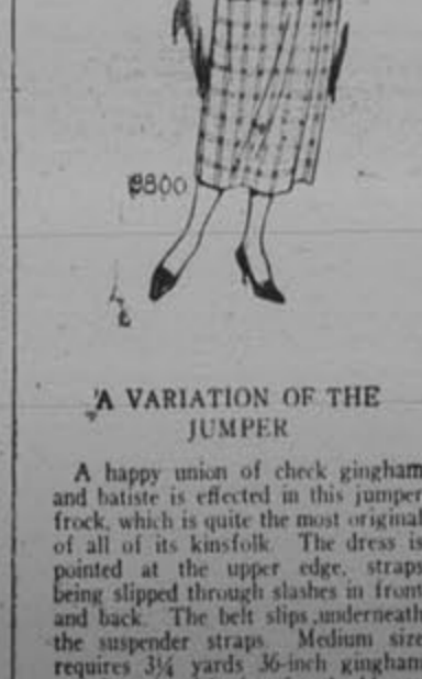
A VARIATION OF THE JUMPER A happy union of check gingham and batiste is effected in this jumper frock, which is quite the most original of all of its kindfolk.