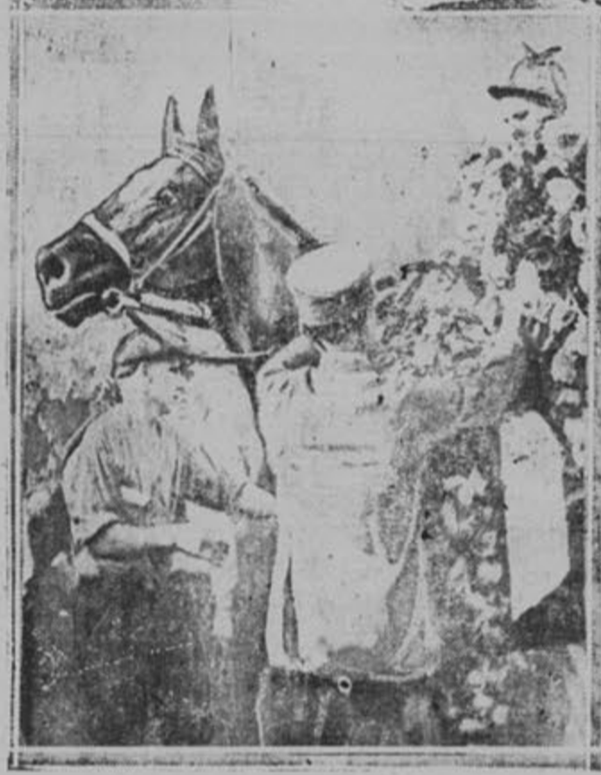
Morvich, "the wonder horse" just after winning the Kentucky Derby.