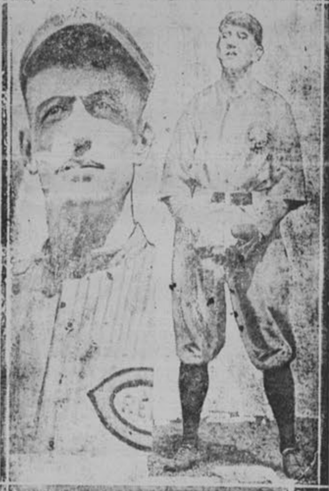
Jake Daubert (at left) veteran first sacker of the Cincinnati Reds, has hit safely in twenty-two consecutive contests. "Rabbit" Maranville of the Pirates recently ran through eighteen games before he was stopped.