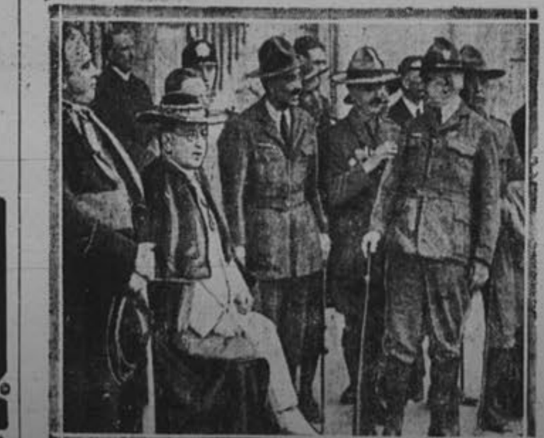
His holiness Pope Pius XI, photographed in the gardens of the Vatican upon the occasion of greeting visiting dignitaries.