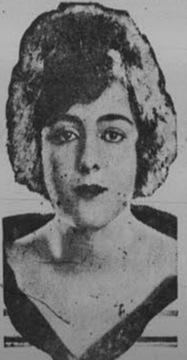
BILLIE DOVE Metro's new star who has been an indefatigable worker in the charity drive for New York's poor.