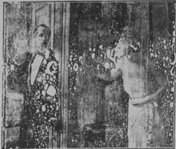
Scene from Wagenhals and Kemper production of "The Bol" by Mary Roberts Rinehart and Avery Hopwood.