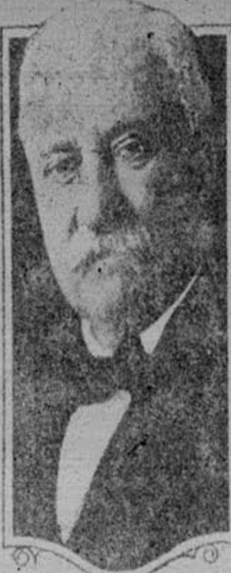
Congressman J. W. Fordney, Chairman of House Ways and Means Committee.

We are importing at the rate of about $300,000,000 worth of foreign goods per month into the United States, declares Congressman J. W. Fordney, Chairman of the House Ways and Means Committee. Most of these goods could be made here. There is not a manufactured article produced in the United States in which the labor cost is less than 50 per cent of the total cost—1 man, following the raw material from start to finish. Now, if that is true, of the $300,000,000 that we are importing abroad each month to buy foreign-made goods, $250,000,000 is going out from the people of the United States to employ German, French, English, Japanese and Chinese labor, while our laborers are waiting the streets in idleness.