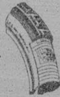
LEE tires made at Escanaba

Equipped with Lee Puncture Proof Pneumatics, your car can be driven anywhere and everywhere, without fear—protected by our cash-refund guarantee against puncture.