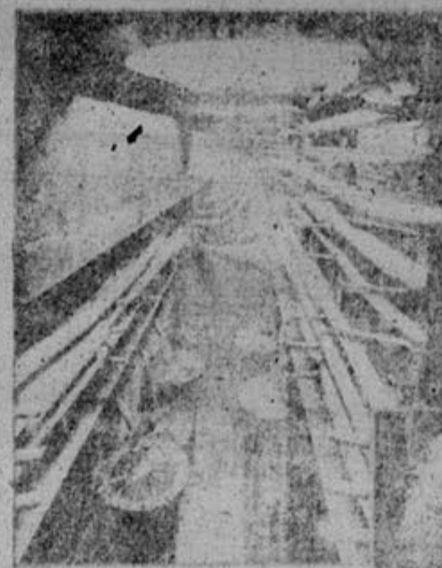
Manila showing building with cables and the New York City street.