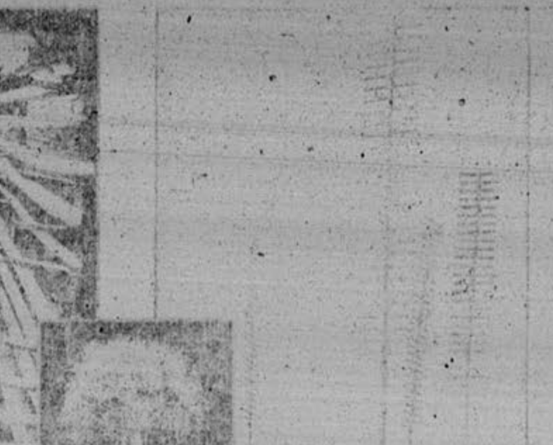
Manila showing building with cables and the New York City street.

The cables are carried under the street in a single corner of the street, and the cables are carried under the street. The cables are carried under the street in a single corner of the street, and the cables are carried under the street.