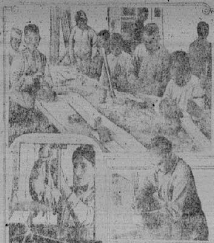
Top - Making the Orphanage Farmhouse - Learning His Bread and Butter as a Trade. Left - Spinning Yarn for Her Mother's Cloth.

GETTING the dollar to do double duty in Armenia is the aim of the American Relief Administration. The children of the orphanages are being taught to make their own clothes and to grow their own food. This is being done by teaching them to spin yarn and to make bread. The children are being taught to work for their own support and to help their parents when they are able to do so.