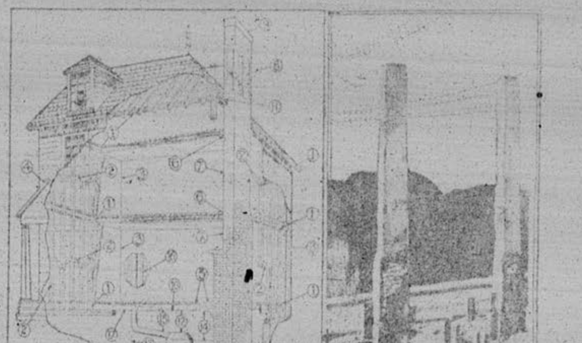
Plan by N. L. M. A. Shows Illustrates New Features of Fire Resistant Construction.