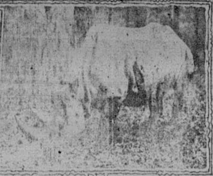
TWO HORNS OF A UNICORN HAD TWO HORNS (SEE DEUTERONOMY)