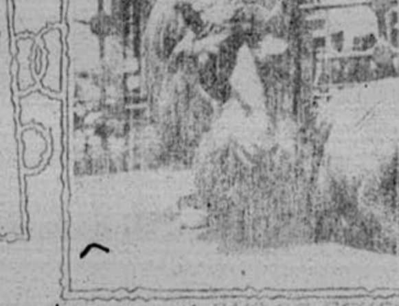
A PAIR OF ELEPHANTS

The "Leviathan" of the Bible is a crocodile, and not a whale. The "dragons" of the Bible are also crocodiles. King Solomon imported elephants from India. The "fish" that swallowed Jonah was a large fish, and not a whale. The unicorn is a mythical creature that does not exist.