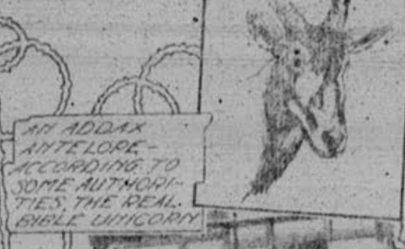
AN ADDAX ANTELOPE - ACCORDING TO SOME AUTHORITIES THE REAL BIBLE UNICORN