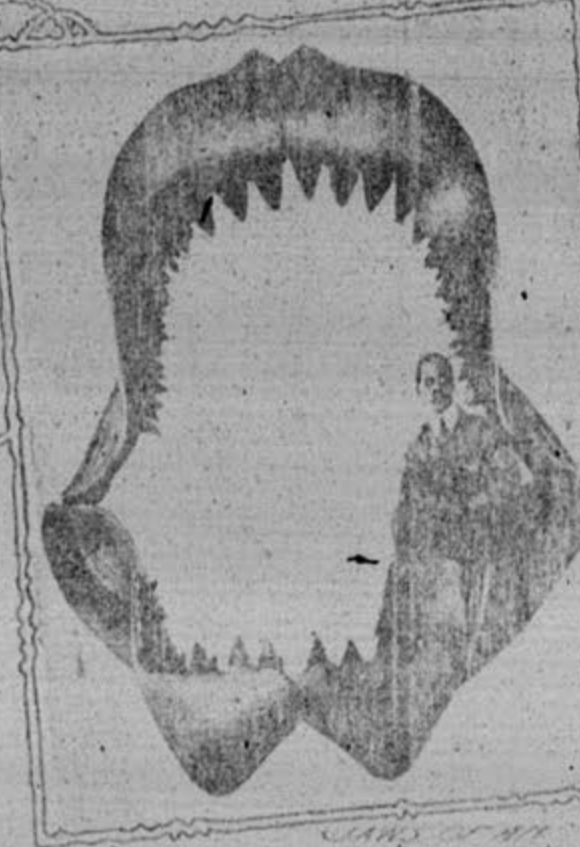
JAWS OF AN EXTINCT SHARK TO WHICH JONAH WOULD HAVE BEEN A SMALL MOUTHFUL