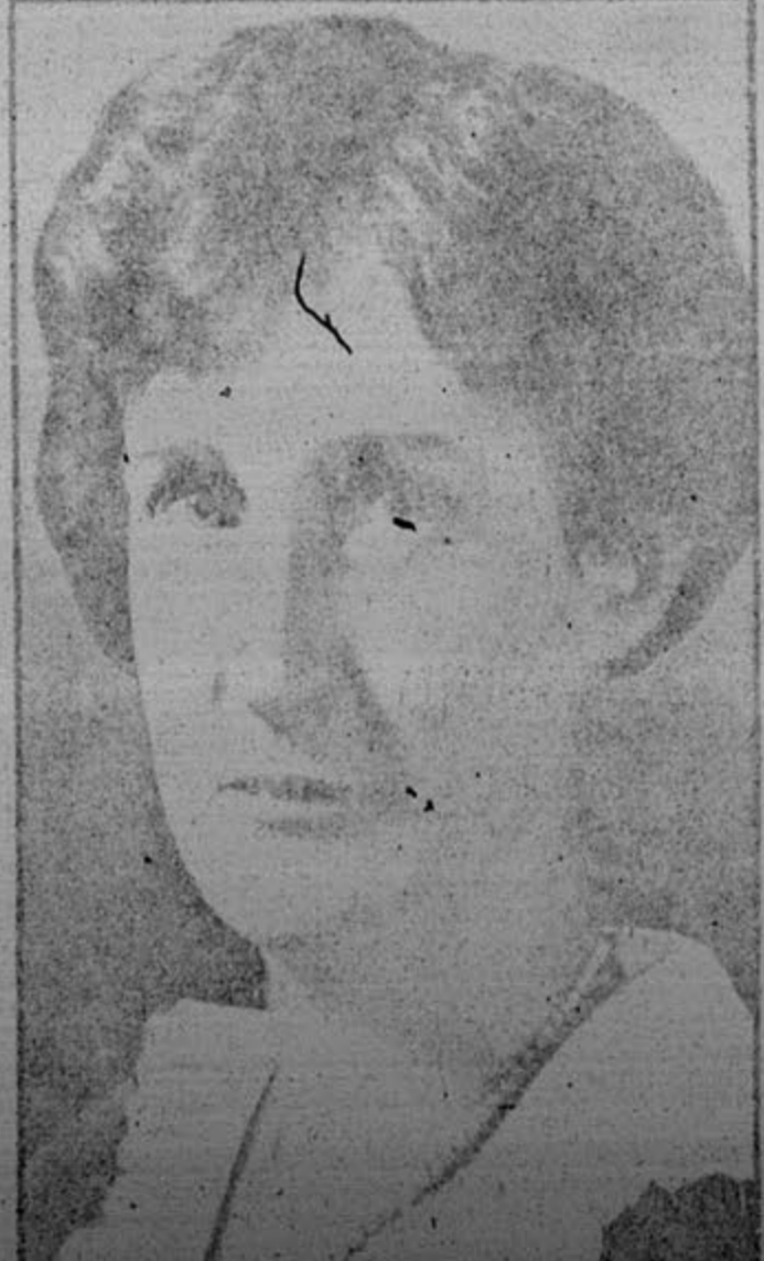
British Hostess at Arms Meet