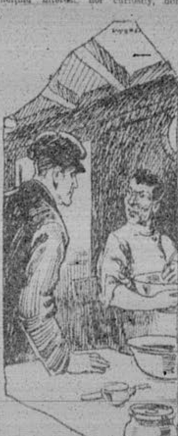
You Are Not Hating Me Because You Are Californian and I'm Japanese.