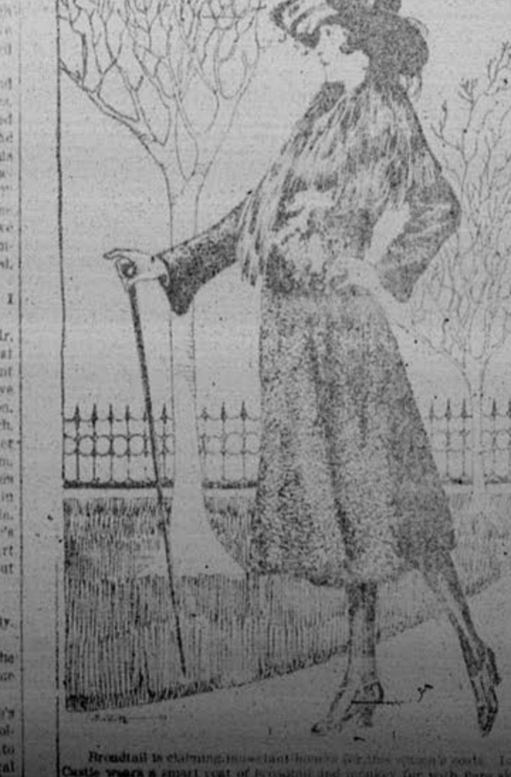
Broadtail to elaborate moment for the woman's work. Long Coats wear a smart coat of broadtail and mink for with there skirt.