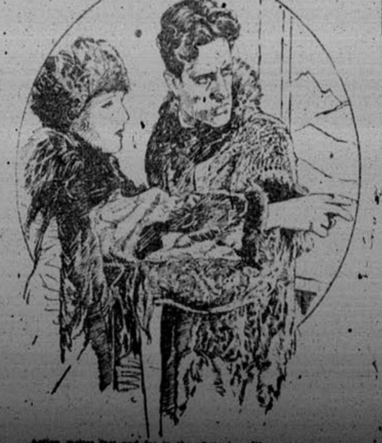
Action scene that and far in the photograph "Thorne" a scene of war and thrills, in which the hero rushes off with his wife and baby from the Orient, where he believes a shadow of two hours over his lips, to Alaska—where, naturally, everything turns out happily. John Gilbert and Marie Prevost, starring here, are the winners in the new film.