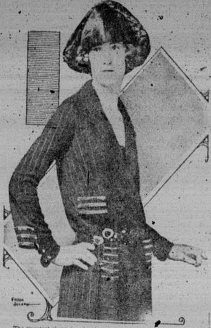
The smartest shape are showing men's fall suits with leather binding and trimmings. A clever use of leather in excellent taste is this shown on suit of black with white pin stripes. The hat is a new turban of black hatter's plash.