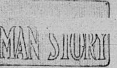
Read Mirror Want Ads

Essencaba people are astonished at the quick results produced by simple sithhazel, camphor, hydrants, etc., as mixed in Lavoptik eye wash. In one case of work and near-sightedness a few days use brought great improvement.