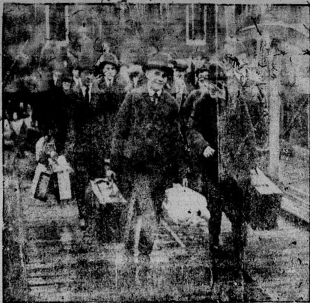
Twenty-three men and women, held by the government to be communists, are on their way back to Europe. Uncle Sam ordered them deported. They were rounded up in cities all over the nation. Most of them are Russians. They are shown starting back.