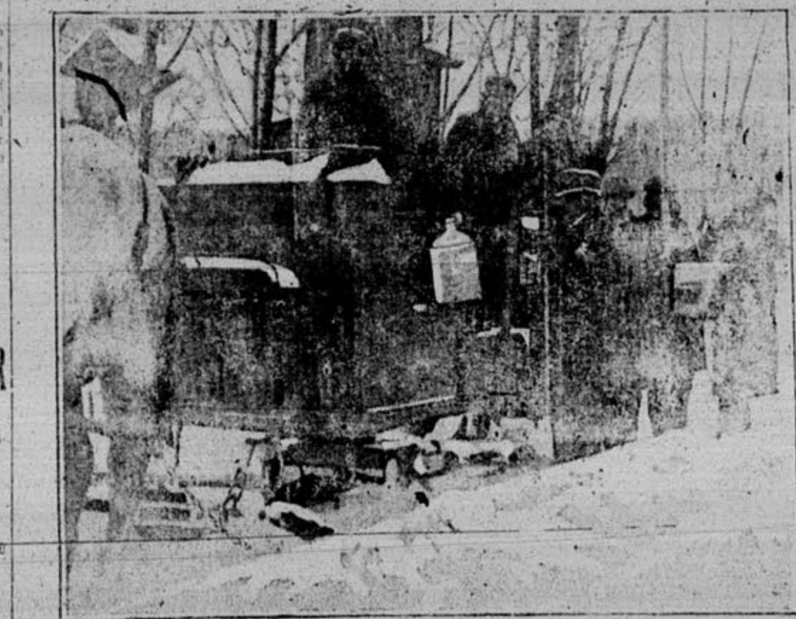
Harley, Wisconsin, was up in the north woods, had the reputation of being the wettest spot per square foot in the dry United States—until a young army of U. S. prohibition officers swooped in and carried off all the moonshine they could find in bobbedies.