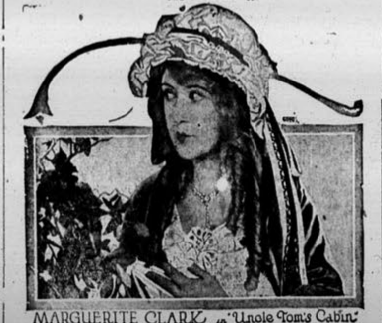
MARGUERITE CLARK in "Uncle Tom's Cabin" A Paramount Picture