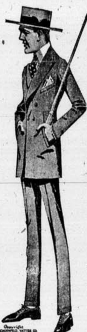
See This Model In Particular

These suits bear a famous label—"Hirsh Wickwire Co." or "Walton." These two trademarks stand for all that is good in clothes-making. It stands for 100 per cent all-wool and no compromise. It stands for 100 per cent of style. It stands for workmanship that is 100 per cent perfect. And these are not merely Easter clothes. They're the sort of clothes that you'll want for your entire season—clothes that have a business-like swing that will appeal to you instantly.