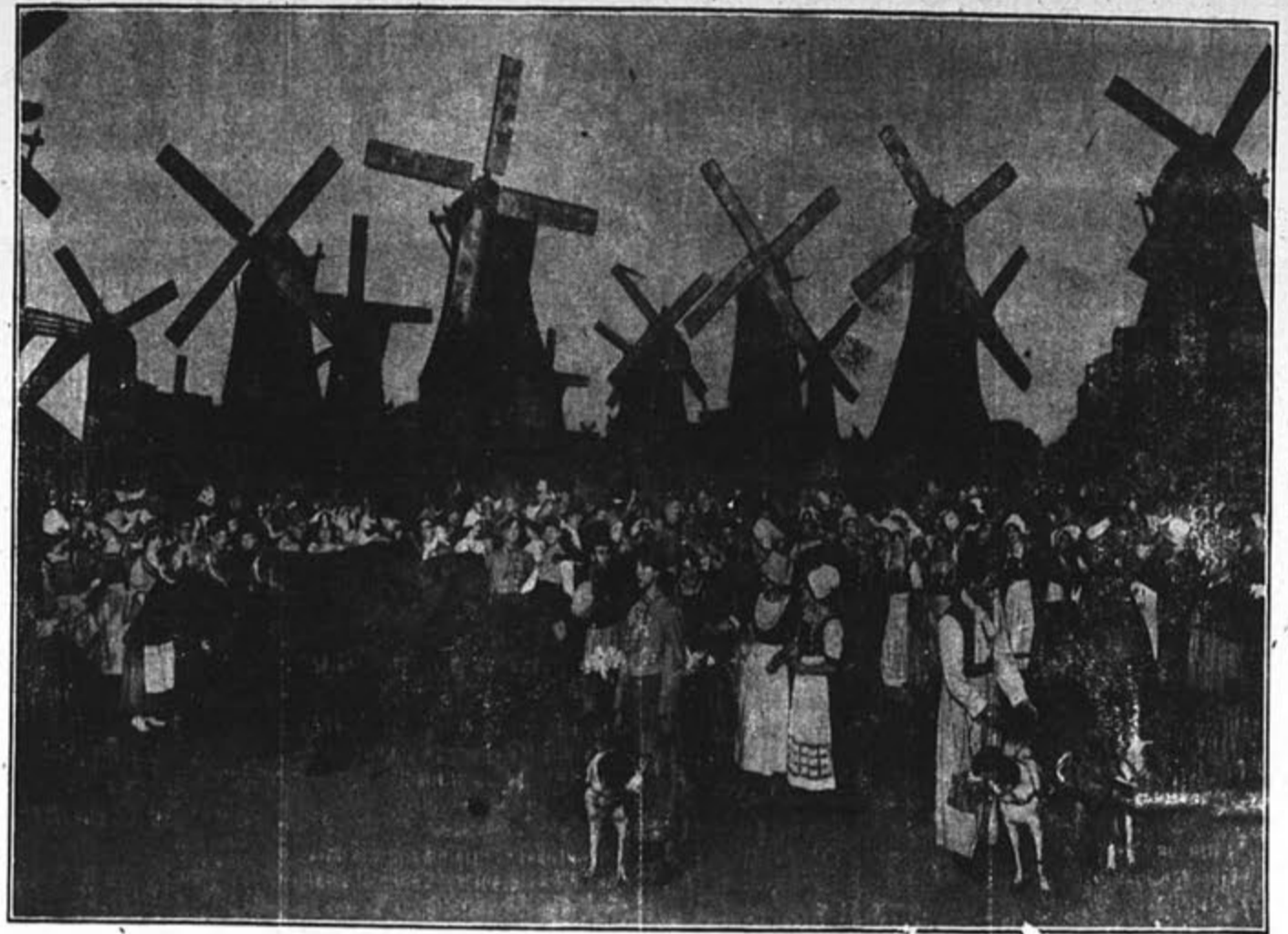
Great Holland scene in "Under Many Flags" at New York Hippodrome.

A silence followed these words, which were spoken with great depth of feeling. It was broken by the judge, who