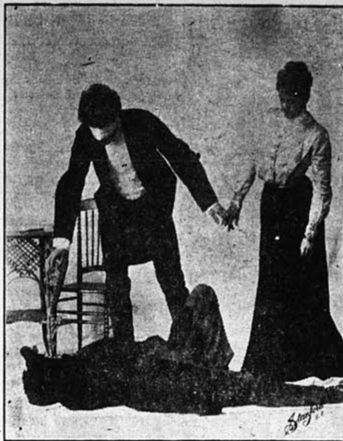
A Murder Scene as Enacted by McIvor Tyndall.

THE GRAND—Tuesday morning McIvor Tyndall the famous London psychic and thought reader will give his celebrated blind fold drive, starting from The Grand at 11 a. m. This will be done under the supervision of representative citizens of Escanaba the permission of the mayor and chief of police having been obtained for this purpose. The committee will seat themselves in a carriage drive over a route known only to themselves and will conceal some object, then return to McIvor Tyndall who allows himself to be blindfolded takes the drivers place with one hand on the shoulder of one of the committee and drives over the route just traveled by the committee and immediately finds without the slightest difficulty the secret object. This is all performed on the main streets of this city free to everyone. Be sure to be on hand. Remember there are but three days of McIvor Tyndall's engagement at the Grand. Don't fail to see him.