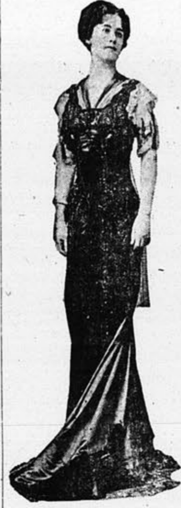
CROWN OF SHIMMERING SATIN. a fashionable restaurant or at a reception would bring forth endless admiration. A contrasting color note is effectively introduced in the sleeves, which are of fine gold lace ornamented with tassels of tiny jet beads.

Shimmering satin and glittering jet make this evening costume one of the most elegant toilets designed for early winter festivities. Its appearance in