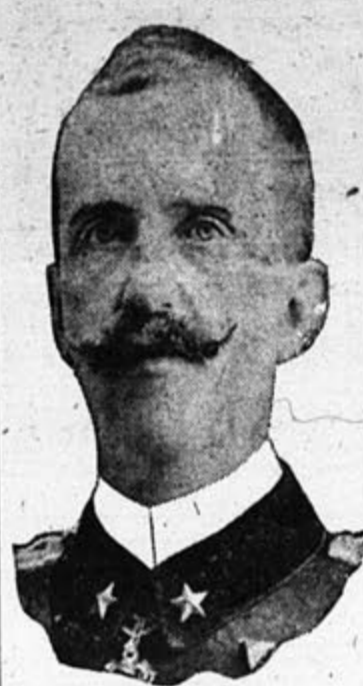
KING VICTOR EMMANUEL

Part of Great Movement to Eliminate Ottomans From Europe and Africa. Comparative War Strength of the Two Nations.