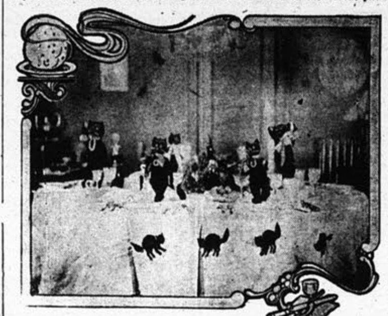
TABLE FOR HALLOWEEN PARTY.

THE Halloween party should be novel to be attractive. The table decoration shown here is one that cannot fail to please the young people.