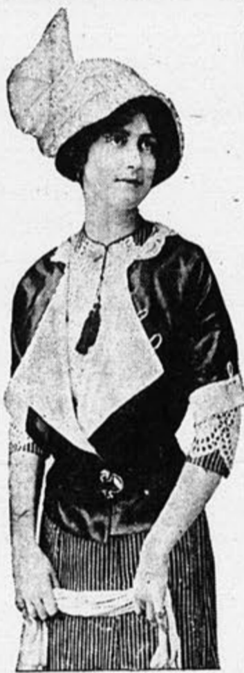
THE NEW BLOUSE

The very newest idea is a blouse which may be worn outside or inside. This convenient garment, seen in the illustration, is of dark blue satin with white crocheted buttons and loops, and the other side is white satin with blue satin buttons and loops. The blue side turns back in revers on the white blouse.