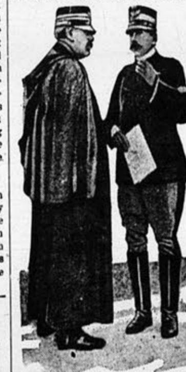
GENERAL POLLIO AND GENERAL SPIN-GARDI, ITALIAN MINISTER OF WAR.