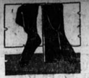
Ladies' Silk Hose.

The Palace Ed. Bittner, Prop. 1115 Ludington St. Phone 120