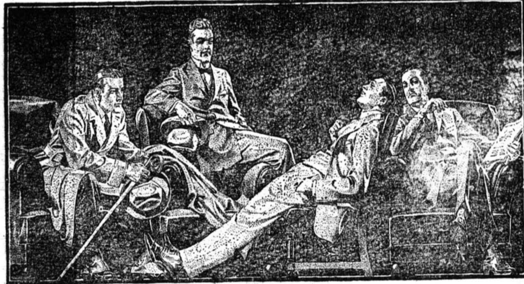
Copyright 1927 The House of Kuppenheimer