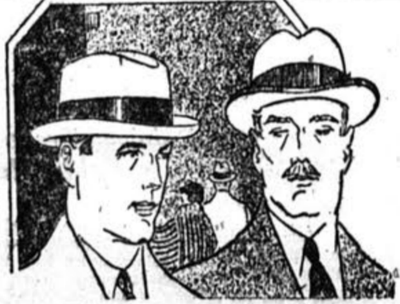
A Style for Every Head!

Clever styles, good fabrics, new patterns, well made—most suits have that extra pair of trousers. Real good values for the moderate purse.