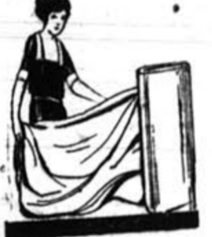
Wool Canton Crepe

Just the hosiery to wear for Fall and Winter—extra fine quality wool with fancy cuff—very popular. 75c