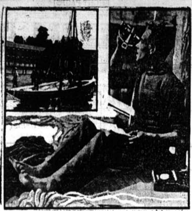
Following the course set for him by Columbus over 400 years ago, Alain Gerhault, French tennis star and yachtsman, crossed the Atlantic alone in the 30-foot sloop Firecrest...