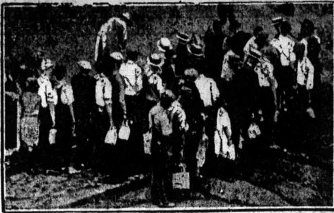
Omaha, Neb., is slowly recovering from a paralyzed water system, which was caused when a mud bank on the Missouri River was washed away near the intake of the water system. Photo shows a crowd at Elmwood Park purchasing spring water.