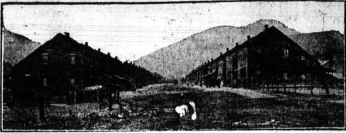
A typical street of company houses in one of the Pennsylvania anthracite mining colonies, where the workers are herded together in ramshackle dwellings like the ones shown above, often sheltering families of from eight to ten persons, who eat, sleep, live, are born and die within the confines of one and two rooms.