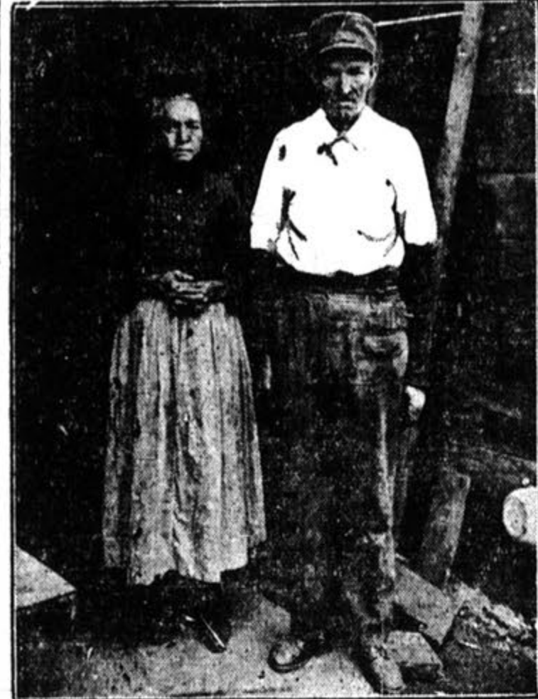
Here is a typical miner of the Pennsylvania anthracite regions come up from the depths a while to catch a bit of sunshine and 40 winds before returning to his working place in the bowels of the earth again. His sphere of activity throughout life is limited to the monotonous routine of digging coal and getting rested to dig some more. He is just one of thousands.