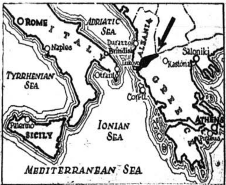
Arrow on the above map shows the approximate location of the place several Italian officers, members of the Commission for the Delimitation of the Albanian Frontier, were killed. Their death caused Italy to send Greece a sharp ultimatum, demanding satisfaction for the killing.