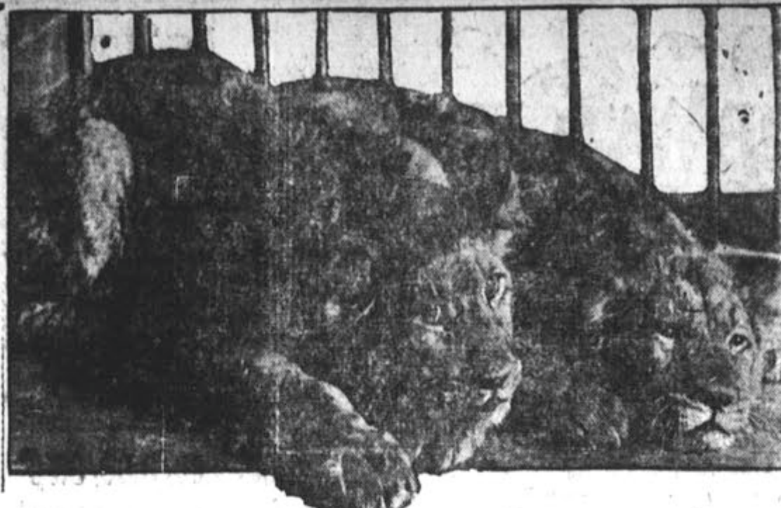
Cute little critters, aren't they? But these two lions are bad actors. They used to frolic for the audience under the "big top."