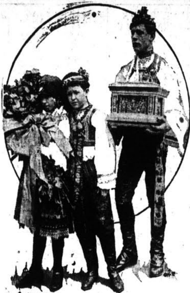
These children, brought from Czechoslovakia by the American Red Cross, visited the White House and presented the hand-carved wooden chest to the president and the roses to Mrs. Harding.