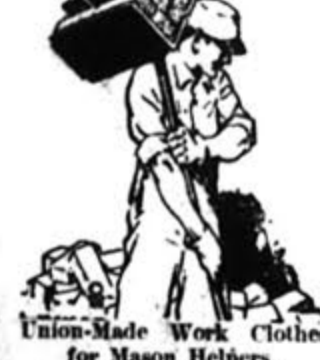
Union-Made Work Clothes for Mason Helpers.