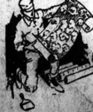
Union-Made Work Clothes for Paper Hangers.