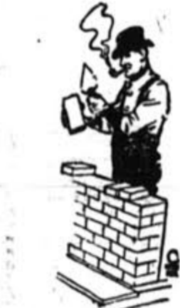
Union-Made Work Clothes for Brick Layers.

Union Made ARMY HATS. Regulation style, khaki color, air vents, also leatherette sweat band. Price $1.95