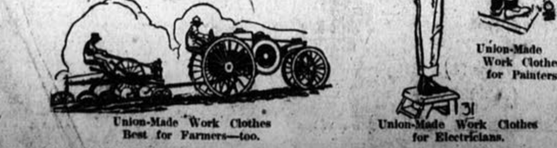
Union-Made Work Clothes for Farmers—too. Union-Made Work Clothes for Painters. Union-Made Work Clothes for Electricians.

These are not special sale prices, but prices at which you can buy Highest Grade Union Made Work Clothes for every day of the week.