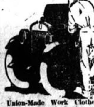
Union-Made Work Clothes for Auto Mechanics.