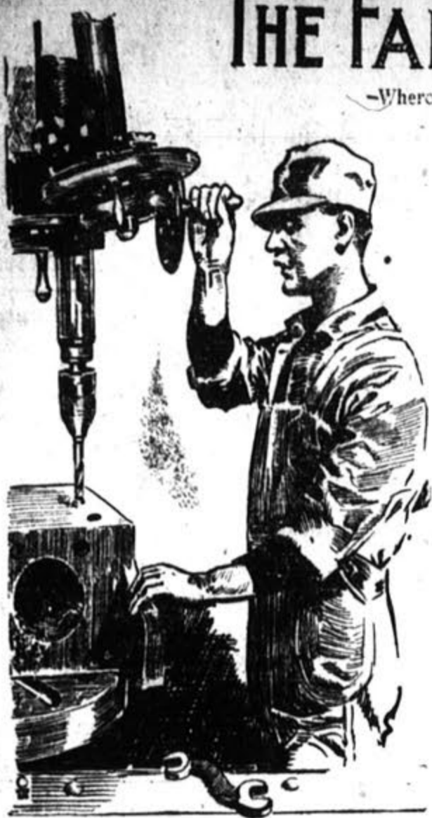
"Union-Made" working clothes for Railroad Men and Railroad Mechanics.

Where Good Values in Good Merchandise Come From.