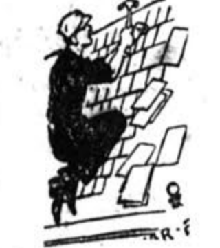
Union-Made Work Clothes for House Builders.