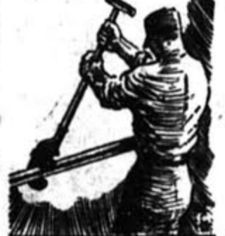
Union-Made Work Clothes for Plumbers.