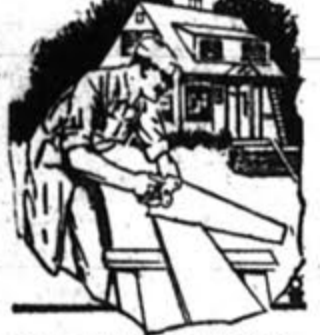
Union-Made Work Clothes for Carpenters.