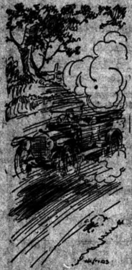
Realized That There Was a Mile-Minute Pace Before Him.