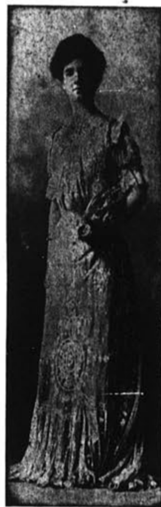
HELENE F. POLMATIN, Cornet Soloist

(Special to Morning Press.) STOCKHOLM, Aug. 26. The local street railroad company has scored a complete victory over the strikers. The men have applied for their old positions, but only a few of them have been taken back.