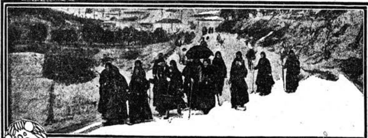
PILGRIMS CROSSING THE VALLEY OF HINNOM

Not only is this true in America, but it is true in every country where celebrations of the sort are held. Even police annals point to that fact, for then crimes are at a minimum.