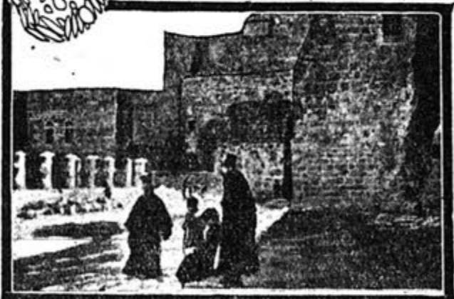
CHURCH OF THE NATIVITY, BETHLEHEM